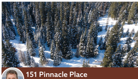
151 Pinnacle Place

6 BR | 7 BA | 6,500 SQFT | $3,499,000 Haden Tanner 208.315.2242