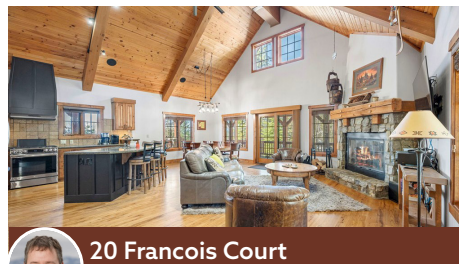
20 Francois Court

5 BR | 5 BA | 5,094 SQFT | $3,345,000 Haden Tanner 208.315.2242