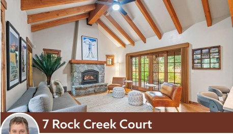
7 Rock Creek Court

2 BR | 3 BA | 1,250 SQFT | $1,249,900 Haden Tanner 208.315.2242