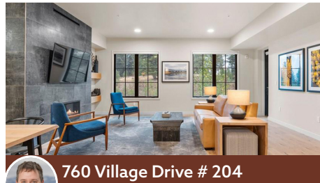
760 Village Drive # 204

1 BR | 1 BA | 796 SQFT | $649,900 Haden Tanner 208.315.2242