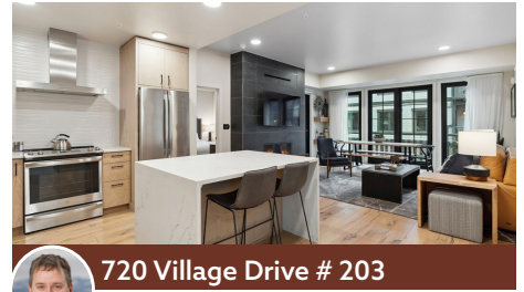
720 Village Drive # 203

3 BR | 3 BA | 1,678 SQFT | $1,199,900 Haden Tanner 208.315.2242