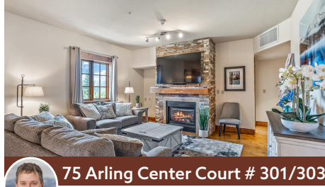
75 Arling Center Court # 301/303

2 BR | 3 BA | 1,250 SQFT | $1,249,900 Haden Tanner 208.315.2242