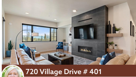
720 Village Drive # 401

2 BR | 2 BA | 999 SQFT | $850,000 Haden Tanner 208.315.2242