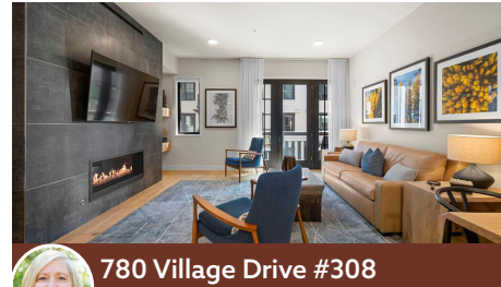
780 Village Drive #308

1 BR | 2 BA | 1000 SQFT | $731,000 Haden Tanner 208.315.2242