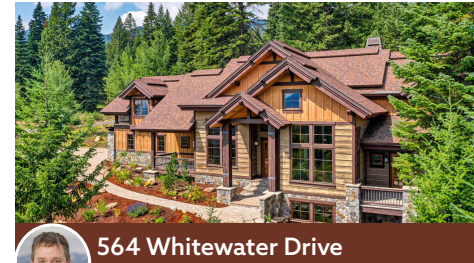
564 Whitewater Drive

1 BR | 1 BA | 798 SQFT | $599,000 Shelly Fisher 208.891.8008