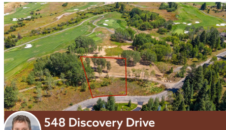
548 Discovery Drive

0.52 Acres | $539,900 Haden Tanner 208.315.2242