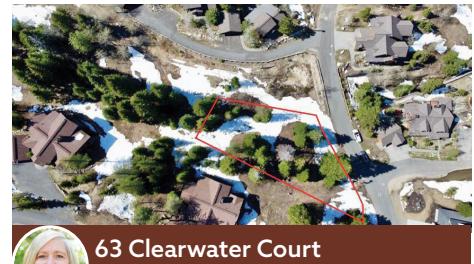
63 Clearwater Court

0.98 Acres | $689,000 Haden Tanner 208.315.2242