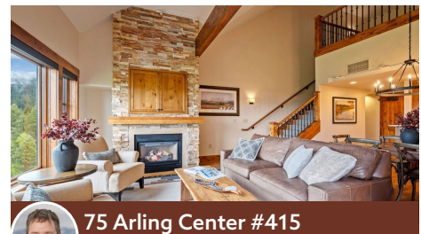
75 Arling Center #415

4 BR | 4 BA | 2,566 SQFT | $2,150,000 Haden Tanner 208.315.2242