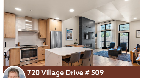
720 Village Drive # 509

3 BR | 2 BA | 1,470 SQFT | $1,299,000 Shelly Fisher 208.891.8008