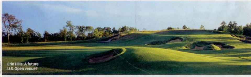
Erin Hills: A future U.S. Open venue?