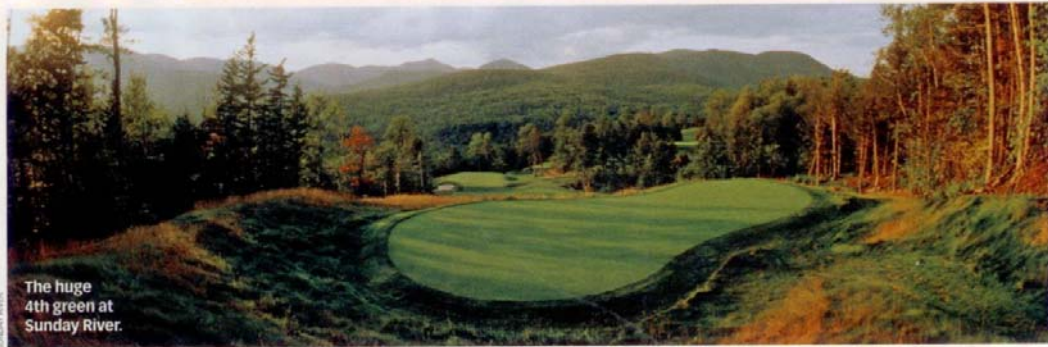
The huge 4th green at Sunday River.

THIS Jim Engh design is back in the Top 100 after a hiatus of two years. In 2006 the sentiment was that the intrusion of houses had ripped away its appeal. Today, the consensus says that the houses still intrude, but not enough to keep this layout off the list. Stretched across the floor of a high-desert canyon, Redlands Mesa boasts one memorable hole after another. Most striking are the cliff-top par-3s that plunge into box canyons, including a trio—8, 12 and 17—that would qualify for anyone's hall-of-fame.