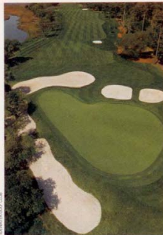
Tidewater, No. 100 on our list.