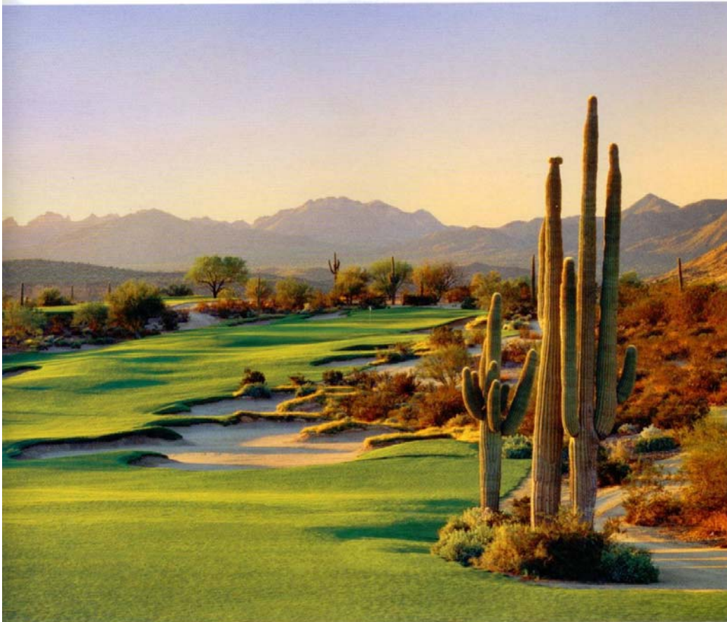
The closing hole at We-Ko-Pa's Saguaro Course, which debuts at No. 44.