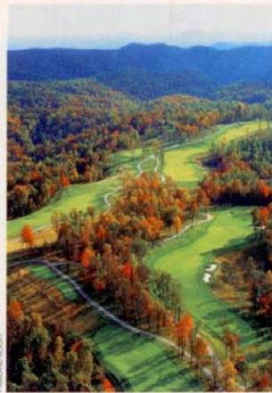
The Highland Course at Primland