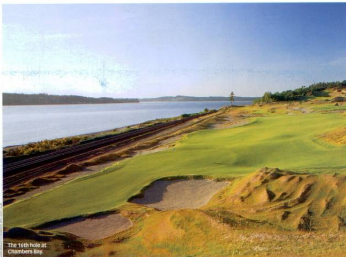
The 16th hole at Chambers Bay.