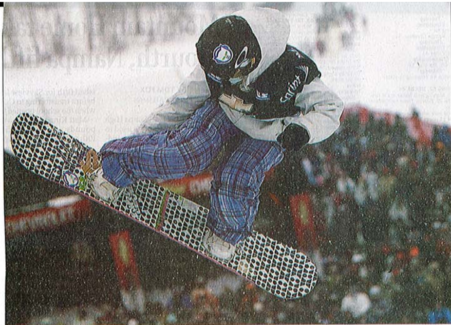
Snowboarder Gretchen Bleiler soars over the crowd in the finals of the snowboard halfpipe competition at the U.S. Snowboard Grand Prix at Tamarack on Saturday. Bleiler, an Olympic silver medalist, finished first in the women's competition.