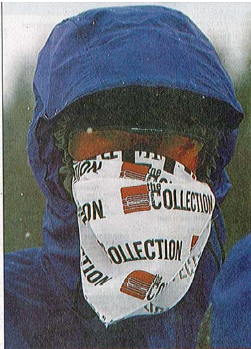
Fans came prepared for the snowstorm and high winds they had to endure while taking in the action at Tamarack Resort on Saturday.